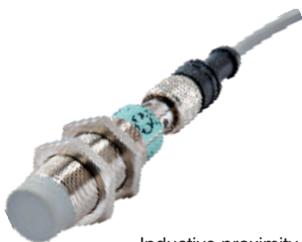
Inductive proximity sensor with cable