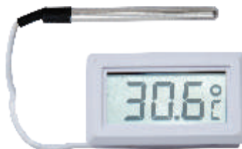
Temperature Indicator with PT100 sensor