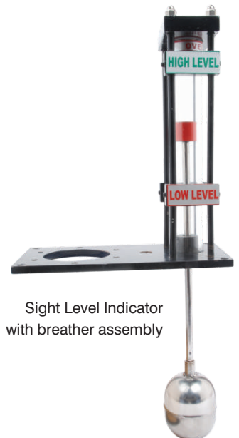
Sight Level Indicator with breather assembly